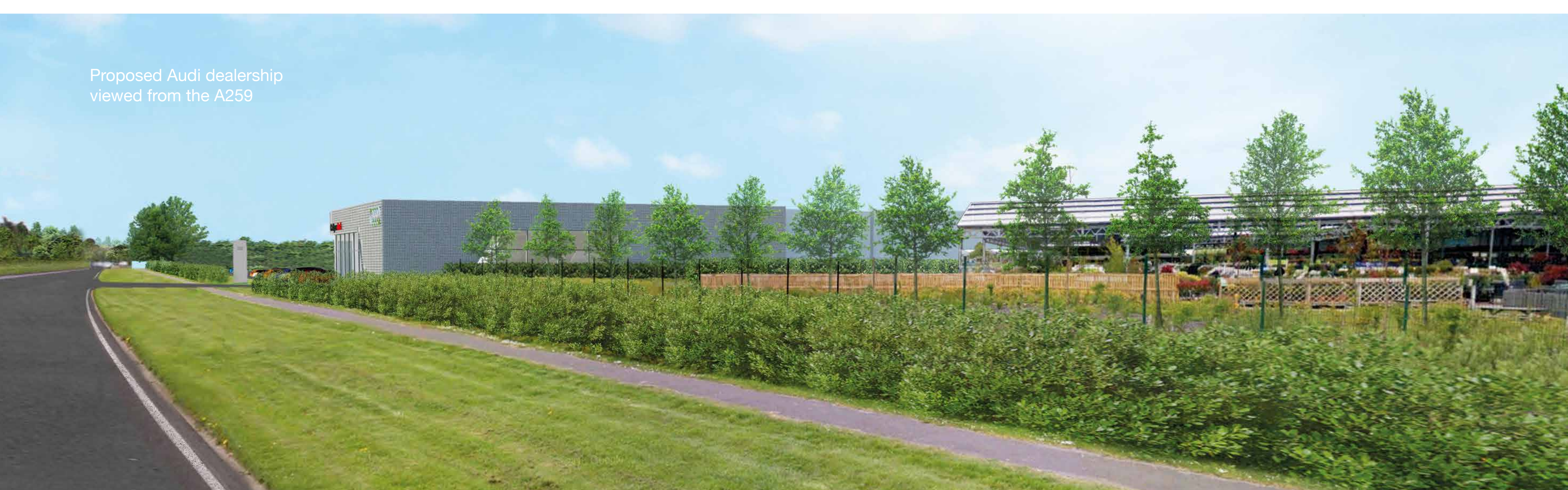
Proposed Audi dealership viewed from the A259

The design of the proposals has been progressed to match the high-quality of the Audi and Caffyns brands, as well as ensuring it sits comfortably in its local context.