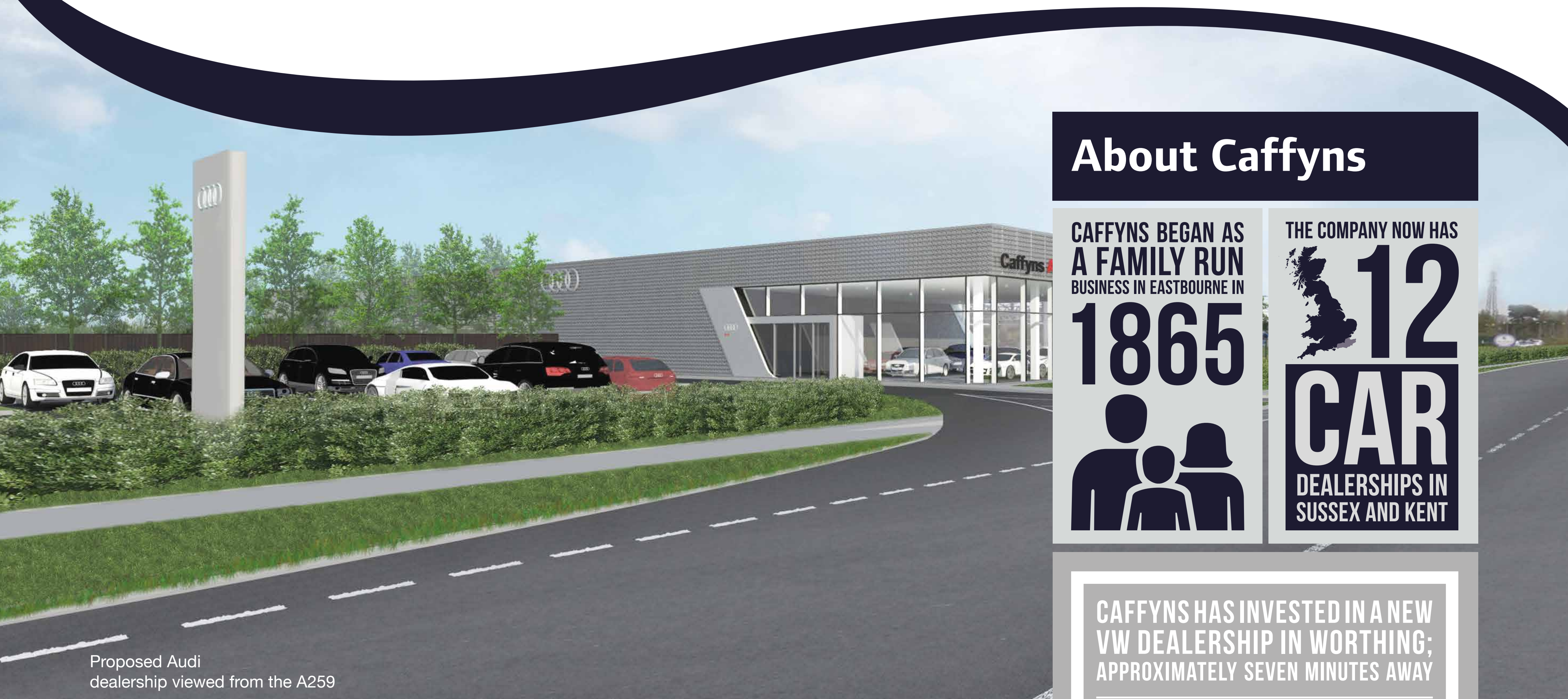
Proposed Audi dealership viewed from the A259