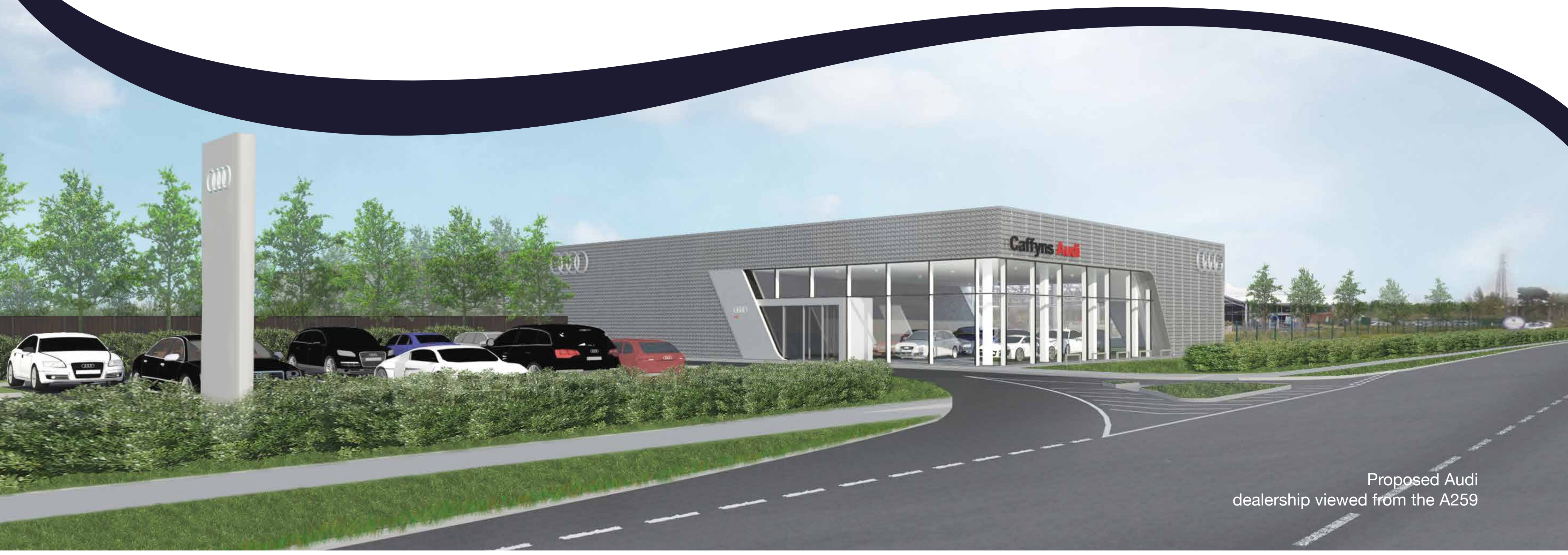
Proposed Audi dealership viewed from the A259