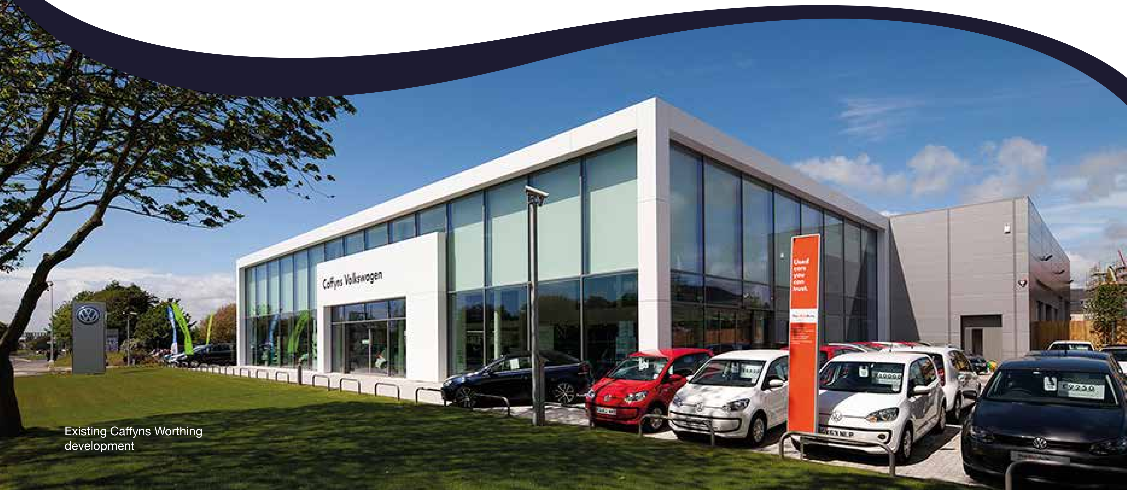
Existing Caffyns Worthing development