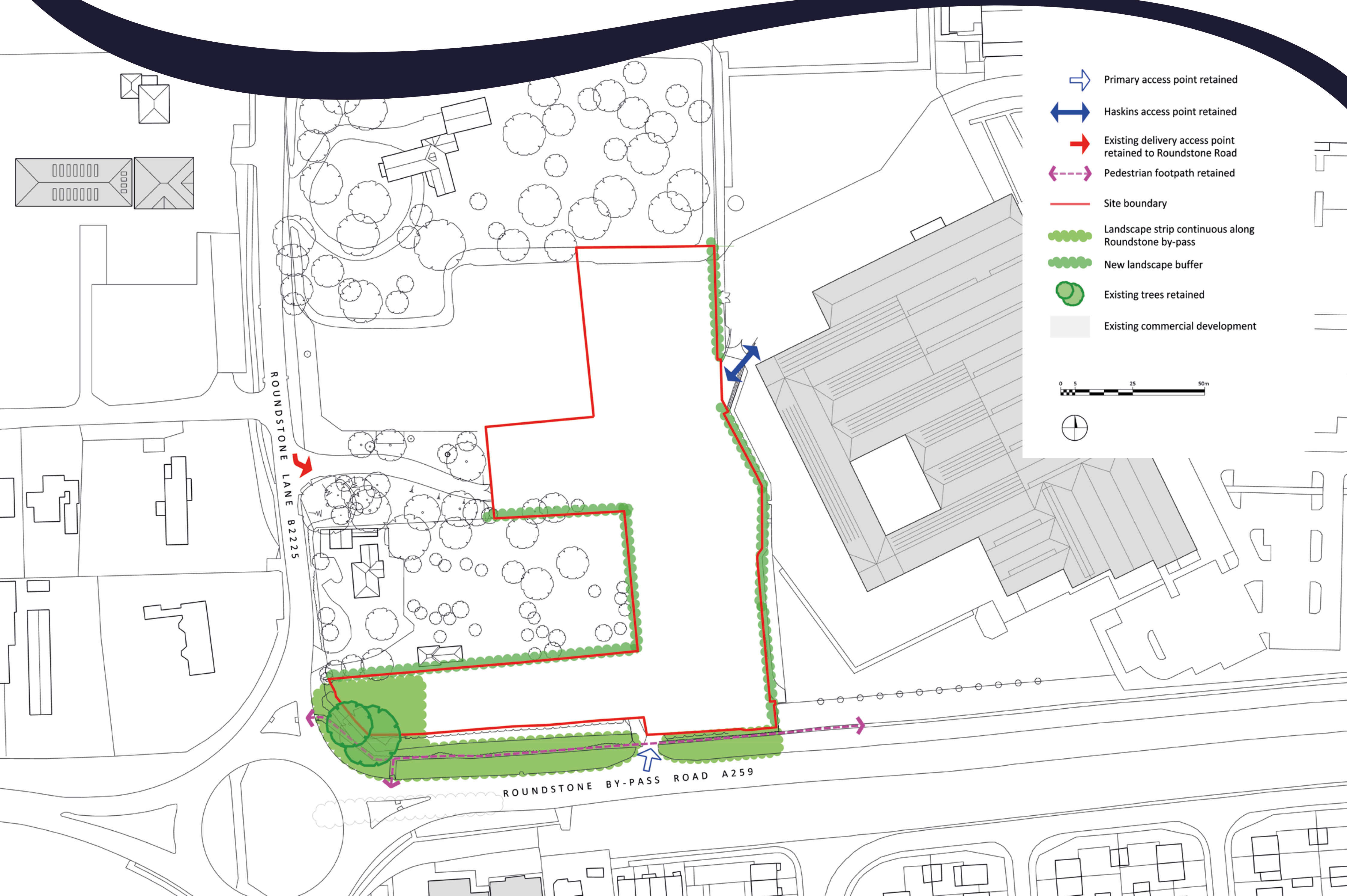
Draft constraints and opportunities plan